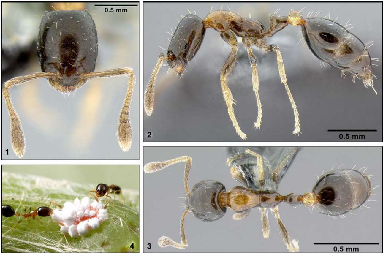
Figs. 1 - 4: Monomorium floricola . (1) Head of worker from Lautoka, Fiji; (2) lateral view of the same worker; (3) dorsal view of the same worker; (4) two workers tending a mealybug on Isla Contadora, Panama (photos 1 - 3 by Eli Sarnat, 4 by Alex Wild).

RY 1894), and Monomorium specularis MAYR, 1866 from Samoa (synonymized by MAYR 1879). HETERICK (2001, 2006) synonymized the two remaining subspecies of M. floricola : Monomorium floricola furinum FOREL, 1911 from Sri Lanka and Monomorium floricola philippinense FOREL, 1910 from the Philippines, though HETERICK (2001, 2006) did not examine the types of either.