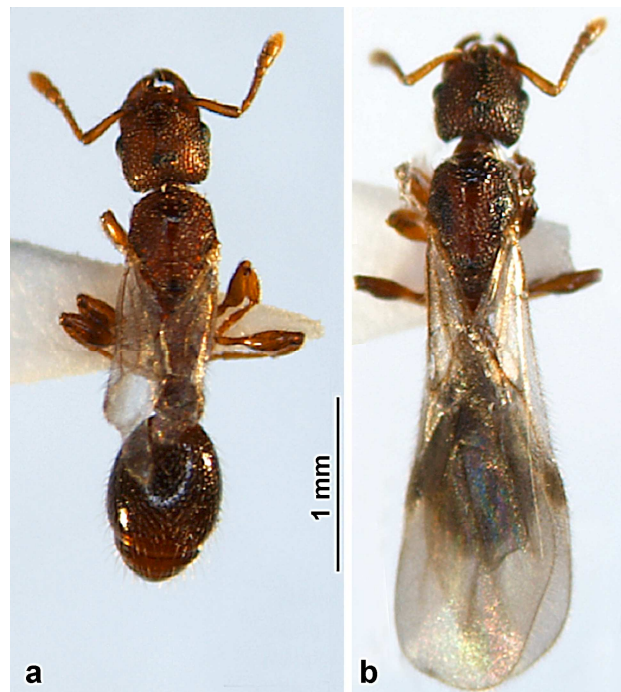
Fig. 1: Wing dimorphism in V. emeryi . (a) Short- and (b) long-winged queens produced from the same colony.

Conditions for inducing long-winged queens in the laboratory: Our field observations (see Results) showed that colonies containing more new reproductives produced more long-winged queens, suggesting that nutritionally rich colonies tend to produce long-winged queens in addition to short-winged queens. To determine the effect of nutritional factors on long-winged queen production, we recorded the number of new queens produced in laboratory colonies kept under different conditions, i.e., eight colonies fed once every two days and eight colonies fed once