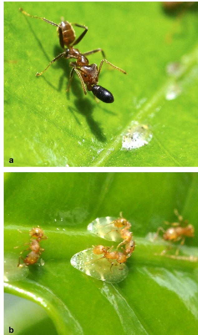
Fig. 2: Ant-hemipteran interactions on coffee. Many species of arboreal ants forage on coffee and tend hemipteran insects in exchange for honeydew. Ants that tend hemipterans often aggressively defend them and indirectly protect their host plant from other herbivores, such as the coffee berry borer (CBB). (a) Here, Azteca sericeasur workers tend the green coffee scale insect, Coccus viridis, while one ant attacks a CBB adult on a coffee leaf. (b) Wasmannia auropunctata workers, known predators of CBB, tend C. viridis on a coffee leaf.