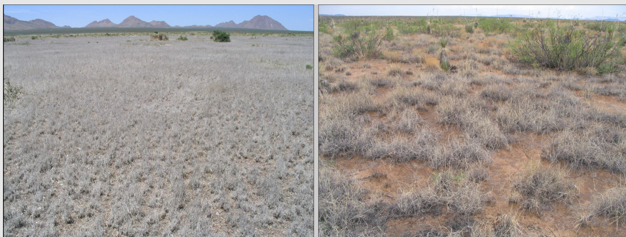
Box-Figs.: A burrograss ( Scleropogon brevifolius ) grassland on silt loam soils (left panel) and a black grama ( Bouteloua eriopoda ) - honey mesquite ( Prosopis glandulosa ) savanna on sandy loam soils (right panel), both located on the USDA-ARS Jornada Experimental Range, near Las Cruces, New Mexico in the Chihuahuan Desert, USA.

Differences emerge at the level of trophic functional groups. Large granivores, especially A. cockerelli and Pogonomyrmex rugosus EMERY, 1895, dominate the biomass in SG. These are species with large body sizes (0.002 - 0.003 g / individual) so they do not contribute much to overall forager abundance. These species are able to exploit the large seeds of certain perennials and annuals in this grassland. In contrast, dominant scavengers such as D. bicolor , Forelius mccoeki (MCCOOK, 1880) and F. pruinosus are small (0.00003 - 0.0002 g / individual) but numerous in SIBG where they tend Homoptera primarily on mesquite bushes. Thus, our analysis points to the idea that shifts in ant functional group biomass may be related to shifts in the plant functional groups, but the total biomass of ants supported remains invariant (even as plant biomass varies between states). This assertion, of course, depends on the assumption that pitfall traps provide a reasonable comparative assay of ant biomass.