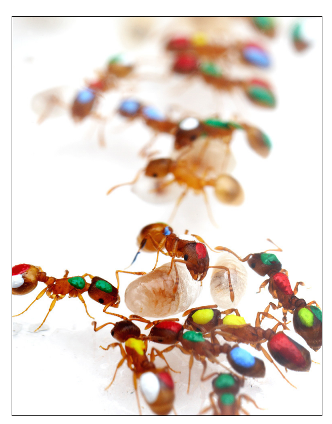
Fig. 1: Individual labelling of ants, usually with paint marks, is crucial for discovery of individual cognitive skills (shown here: Temnothorax rugatulus , photograph by Alex Wild ©).

GERBER & al. 2004b, MEHREN & al. 2004, SRINIVASAN & ZHANG 2004, ROBINSON & al. 2005, GRONENBERG 2008), although we are still far from mapping a complete neural circuit for any moderately complex behaviour. Second, the immense number of insect species allows comparative studies to link cognitive abilities to ecology, and thus quantify the fitness benefits of cognitive skills such as information processing and learning (CHITTKA & al. 2004, RAINE & al. 2006a, RAINE & CHITTKA 2007b). In addition, researchers are beginning to investigate costs as well as benefits of cognition-related genes (MERY & KAWECKI 2003, CHITTKA & al. 2004, MERY & KAWECKI 2004). Eventually, a more thorough understanding of benefits as well as costs of cognitive skills should enable us to understand how and why a diversity of such skills has evolved in animals.