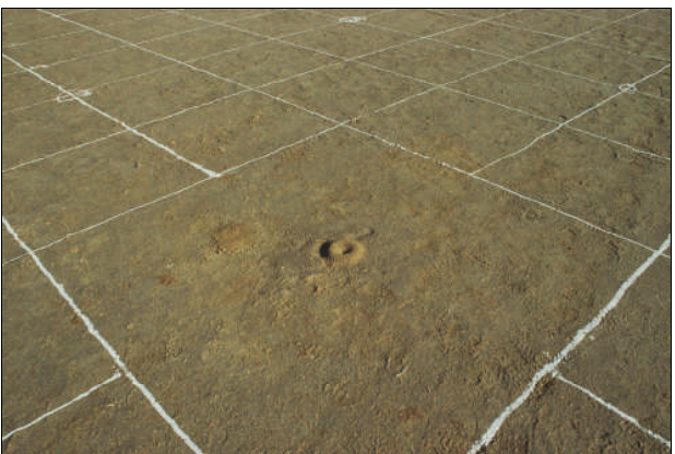
Fig. 2: Ants encounter the problem of orienting in a complex environment particularly during foraging trips. The challenges faced by the ants, and the possible solutions, however vary enormously with the habitat: some habitats may lend themselves to using landmarks or patterns on the horizon for orientation, whereas some desert ants rely more on path integration because of the lack of landmarks.

& JOHNSON 1966, FRISCH 1967). Knowledge about food source attributes also modulates other behaviours: if learned visual stimuli are not sufficient to discriminate food sources, honey bees deposit additional scent marks to guide them (GIURFA & al. 1994). Both bees and wasps may also perform "learning flights" around new food sources or around a familiar site if landmarks have changed (LEHRER 1996, WEI & al. 2002), indicating that in this context, bees "know what they know", and actively seek to learn more if necessary (WEI & al. 2002). Bees can also use prior knowledge about which stimuli they are likely to encounter to recognise poorly visible or camouflaged objects (ZHANG & SRINIVASAN 1994).