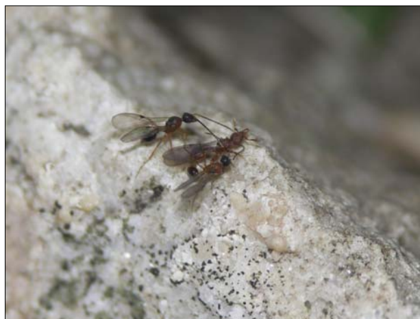
Fig. 1: Two males of Pyramica argiola , courting a gyne. Mating only happens on the ground near the area of the courtship display.

The distribution area of P. argiola is centred around the Mediterranean basin (BERNARD 1968), which implies that