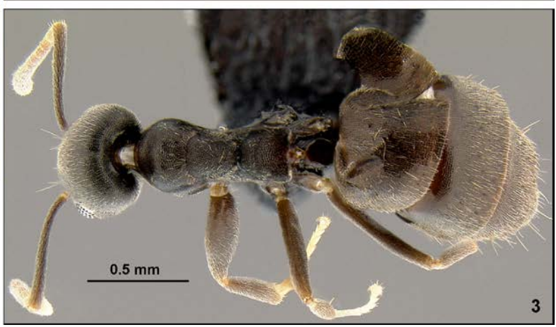
Figs. 1 - 4: Technomyrmex difficilis . (1 - 3) Worker from 10 km NW Lockhart River, Australia (CASENT 0171131), (1) head, (2) lateral view, (3) dorsal view. (4) Worker tending a mealybug, Cape Tribulation, Australia.

identity of most published "T. albipes" records from the Old World without examining the specimens. BOLTON (2007) believed that all recently published records of T. albipes from Australia were probably misidentified T. difficilis, as were at least some published records from Pacific islands in WILSON & TAYLOR (1967). But, as BOLTON (2007) pointed out, in the absence of specimens, the actual identity of a great many published T. albipes records "must remain equivocal".