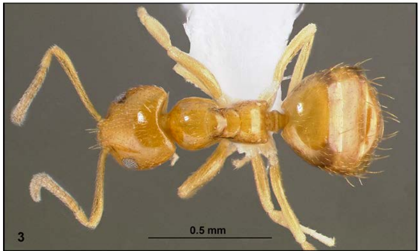
Figs. 1 - 3: Plagiolepis alluaudi . Worker from Forêt d'Orangea, Madagascar (CAS-ENT0429209), (1) head, (2) lateral view, (3) dorsal view.