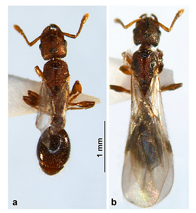
Fig. 1: Wing dimorphism in V. emeryi . (a) Short- and (b) long-winged queens produced from the same colony.

Conditions for inducing long-winged queens in the laboratory: Our field observations (see Results) showed that colonies containing more new reproductives produced more long-winged queens, suggesting that nutritionally rich colonies tend to produce long-winged queens in addition to short-winged queens. To determine the effect of nutritional factors on long-winged queen production, we recorded the number of new queens produced in laboratory colonies kept under different conditions, i.e., eight colonies fed once