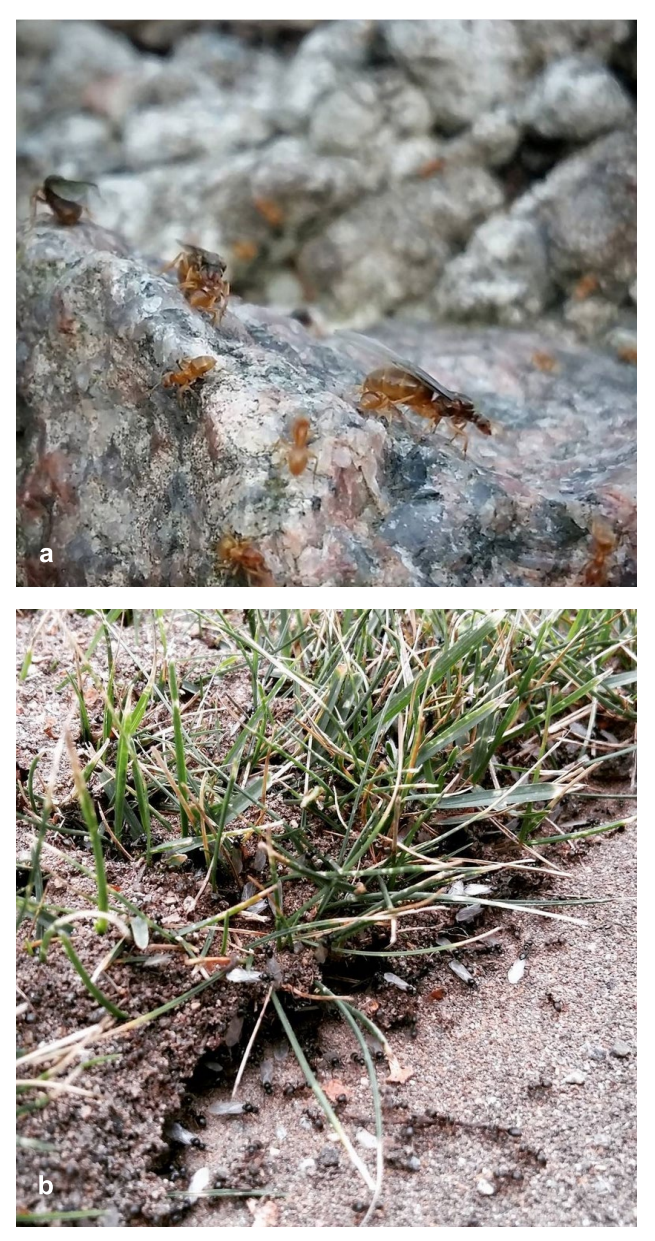
Fig. 3: (a) Lasius flavus gynes and workers have climbed on a rock above their nest. The workers of this subterranean species are rarely seen above ground expect at the onset of dispersal. (b) Lasius niger males emerging from their nest. Photographs by S. Hakala.

In ants, workers take care of brood, and sex allocation is in many cases consistent with worker control (MEU-NIER & al. 2008). Thus, workers may affect the dispersal patterns by controlling the sex ratios of the brood and the gyne-worker ratio of the female brood (RATNIEKS & al. 2006). Workers can also indirectly affect the dispersal behavior of individual dispersers, since dispersal decisions are often condition dependent (BOWLER & BENTON 2004), and workers have the possibility to control larval development and thus the condition of dispersing individuals. However, the relative contribution of workers and the individuals themselves has been assessed only in a few cases. Studies on the genetic architecture behind the mass of individuals have revealed complex interactions between individual genotype and the social or indirect genetic effect