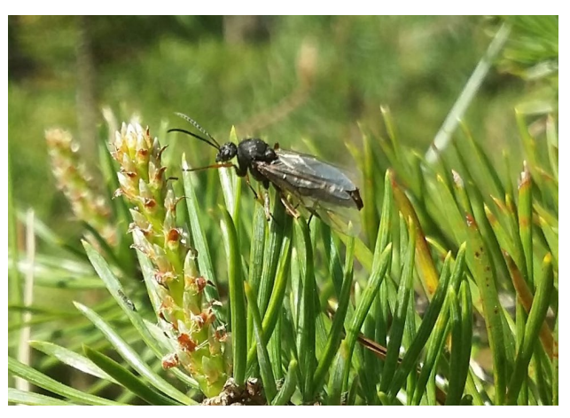
Fig. 1: Formica pratensis male has left the natal nest and climbed to a tree branch above it, ready to fly.

Dispersal strategies of ant males: Ant males are traditionally seen only as the vehicles of sperm, and not much more. Their role inside the colonies during their development has not evoked much interest (SCHULTNER & al. 2017), and their life outside the colonies is usually described by a single word: short. Ant males can potentially allocate all their resources to mating and dispersal, and do not need to invest in longevity, for example through costly immune defenses (BOOMSMA & al. 2005, STÜRUP & al. 2014). Detailed studies on male ants have focused on only a few species, such as Atta leaf-cutter ants (e.g., BAER & BOOMSMA 2006, STÜRUP & al. 2011). As male behavior and mating strategies vary a lot in other social Hymeno-